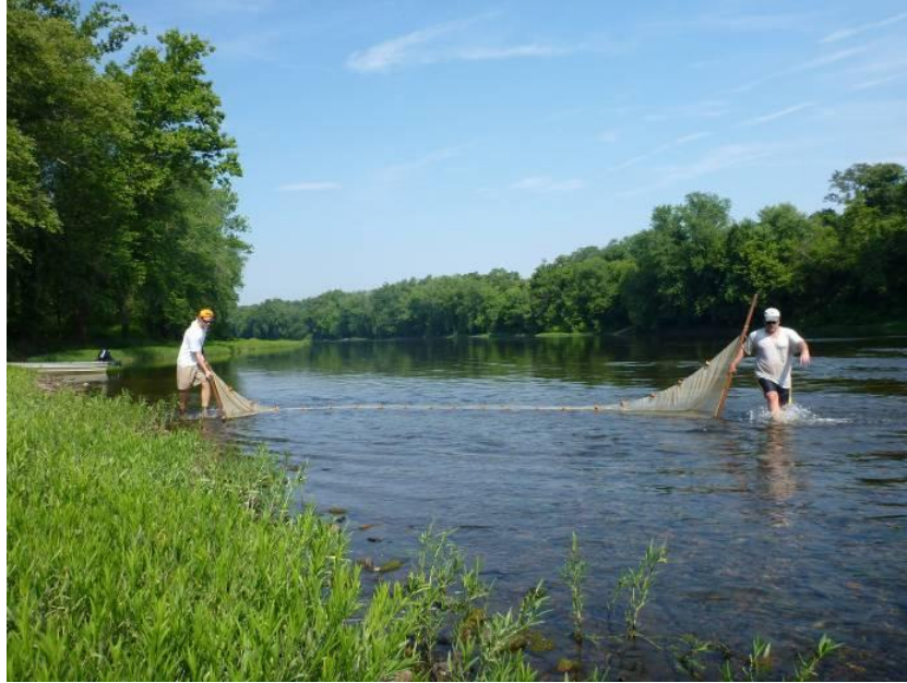
Figure 1. Conducting the nontidal Potomac River watershed summer seining survey for young-of-year smallmouth bass.