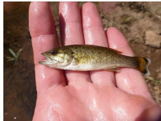
Figure 2 & 3. Young smallmouth bass collected during the annual Potomac River watershed seining survey.